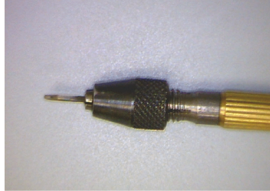
Micro Chisel in Pin Vise

Bonding Source introduces a family of Micro Chisel Blades for use in microelectronics assembly and rework. The blades are used for die removal, and to clean excess cured epoxy and solder. The chisel blades are more effective than traditional Exacto or Beaver blades for these tasks because of the flat chisel face.